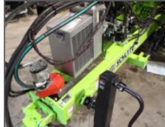
Windrower hydraulic pump and cooling system ties into tractor PTO