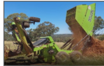
Dumping height 8' 7" (2616mm) allows for larger piles when dumping