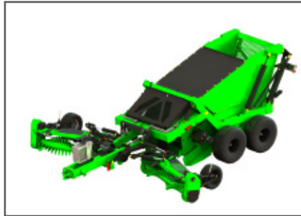
Weight: 15015lbs (6825kgs) Height: 122" (3100mm) Length 310" (7890mm)

540-1-3/8" 6 Spline, 1000-1-3/8" 21 Spline, 1000-1-3/4" 20 Spline