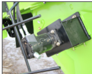
All hydraulic motors have a built in cushion valves for longer life