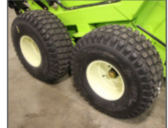
Tandem walking axles with 16.5L X 16.1 X 10 ply flotation tires