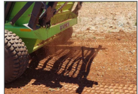
The area behind the rock picker is left clean, with stones sized from 2"-27" (5cm - 69cm) removed