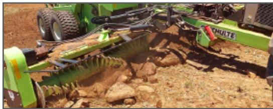
Rocks are easily removed by the two side windrowers with a variable working width of up to 19' (5.8m)