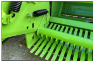
Heavy duty batt springs, 450 BNH steel reel and grate with replaceable teeth