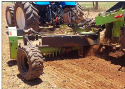
Windrowers with durable castor tires ensure rocks are easily moved away leaving a clean surface