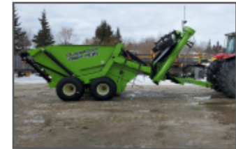
Transport width is only 118" (under three metres)