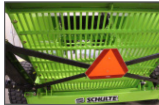
Rear and bottom grates ensure soil is easily sifted through the hopper