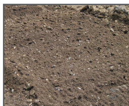
After Multi Rake use