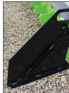
Adjustable, reversible side plates