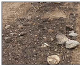
Before Multi Rake use