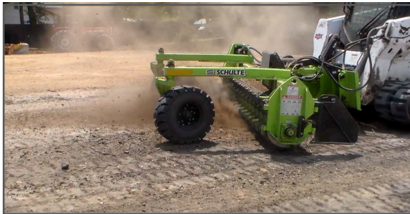
Great for land use soil preparation

The SMR-600 is chain driven to keep the hydraulic motor out of harm's way.