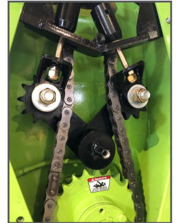
Chain case with tensioner and heavy #80 chain with easy access opening plate.