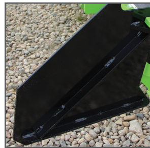
Adjustable, reversible side plates can be mounted on front or back of the unit