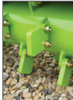
Replaceable teeth 4" & 2 1/2" 450 BHN steel