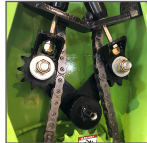
Chain case with tensioner and heavy #80 chain which is run in an oil bath and accessible with an easy access cover plate.

Hydraulic motor options are available to suit skid steer hydraulic flow.