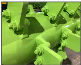
Replaceable teeth 4" & 2 1/2" 450 BHN steel