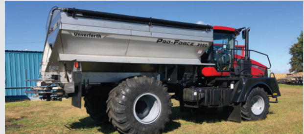
Truck Floater Chassis