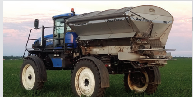
Row-Crop Sprayer Chassis