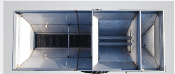
Tri-Force Hopper Multi-Product Spreading