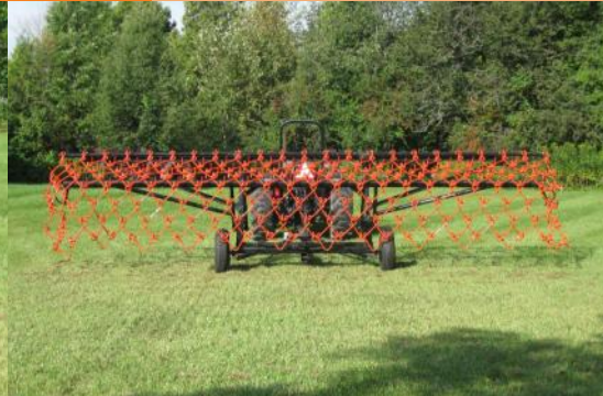
Handles harrow widths of 17' through 26'.

Swivels for narrow width transporting - less than 8 1/2 ft.