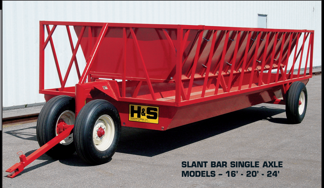
SLANT BAR SINGLE AXLE MODELS - 16' - 20' - 24'

Slant bars help prevent cattle from moving in and out. Low, comfortable height of tank sides. All sizes of cattle can feed with heads in unit (EXCEPT CATTLE WITH HORNS) .