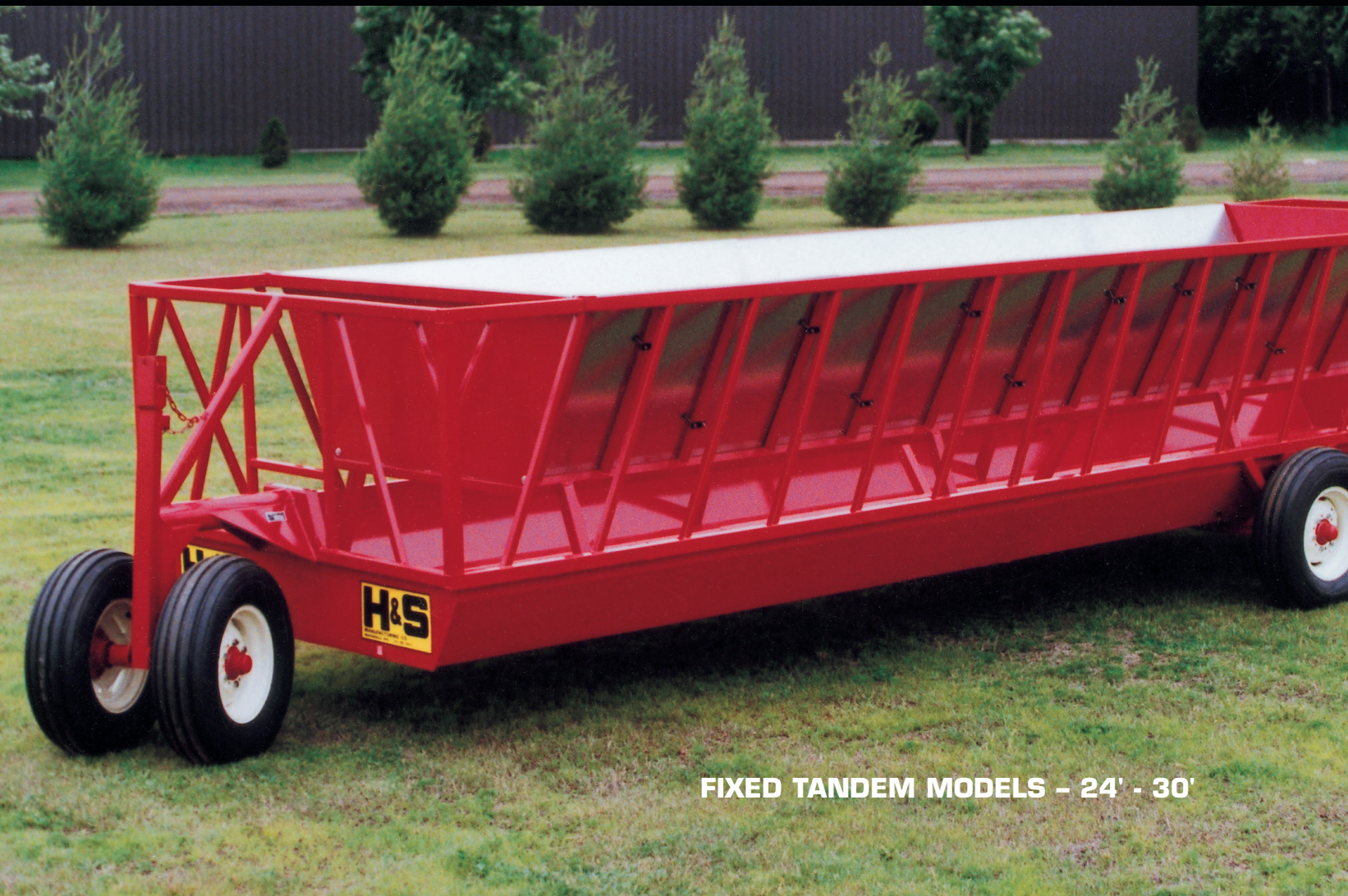
FIXED TANDEM MODELS - 24' - 30'

Slant bars help prevent cattle from moving in and out. Low, comfortable height of tank sides. All sizes of cattle can feed with heads in unit (EXCEPT CATTLE WITH HORNS) .