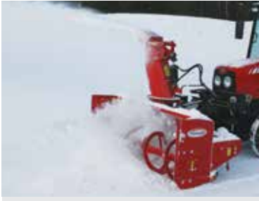
PRONOVOST GROUPS I, II, III AND GV