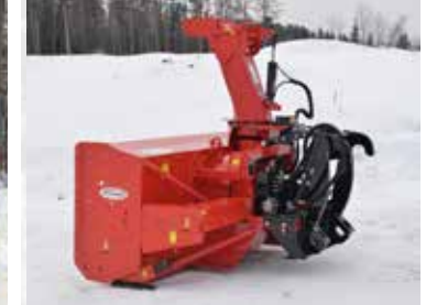
HYDRAULIC HIGH EFFICIENCY