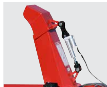
Electric actuator (Puma-48 to Puma-72)