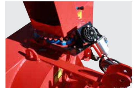
Electric motor (Puma-48 to Puma-72)