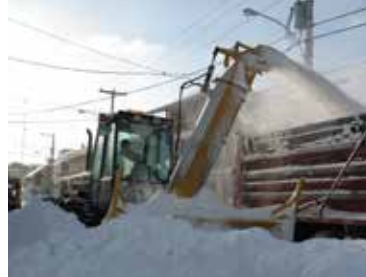
INDUSTRIAL, FULL FLIGHT AUGER