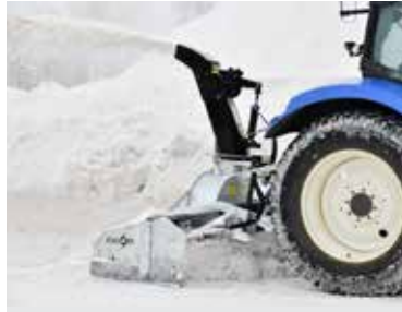
CYCLONE BY PRONOVOST