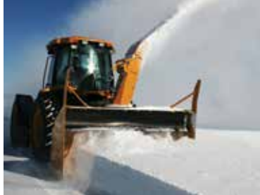
INDUSTRIAL, OPEN FLIGHT AUGER (PGV)