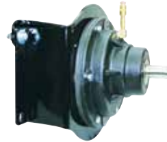
540 / 756 Ratio 1:1.4