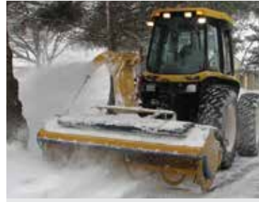
PXPL / X-PRO