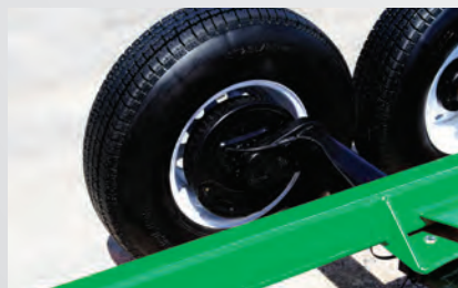
Available electric brakes