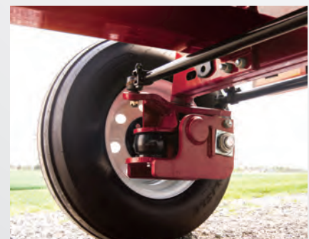
4-point rubber-cushioned suspension