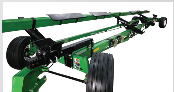
JD hinged draper package