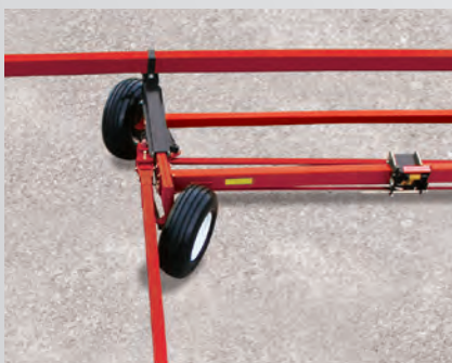
180° front steering