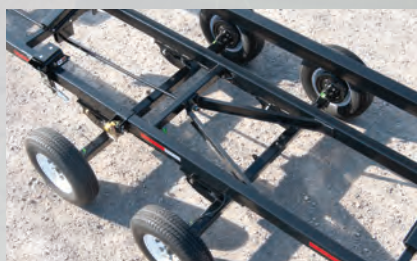
Adjustable rear axles