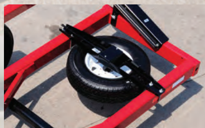
Optional spare tire