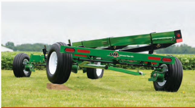
Rear oscillating axle