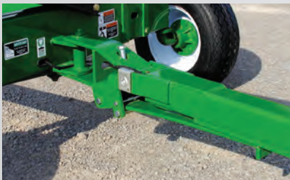
Spring-lift assist tongue