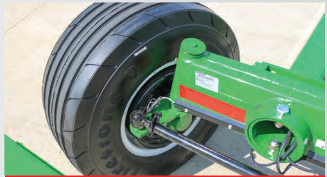
Optional 2- or 4-wheel brakes