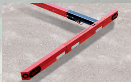
Width-adjustable LED light bar