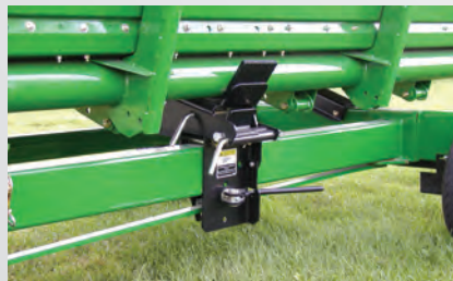
Standard tool-free 4-way adjustable rest bracket