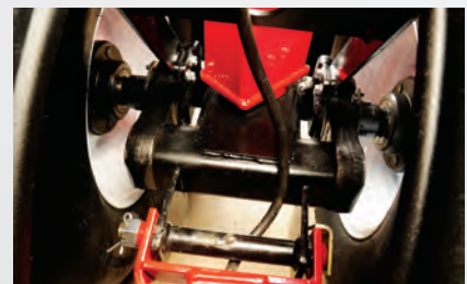
Front torsion suspension