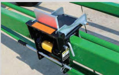
4-Position rest bracket