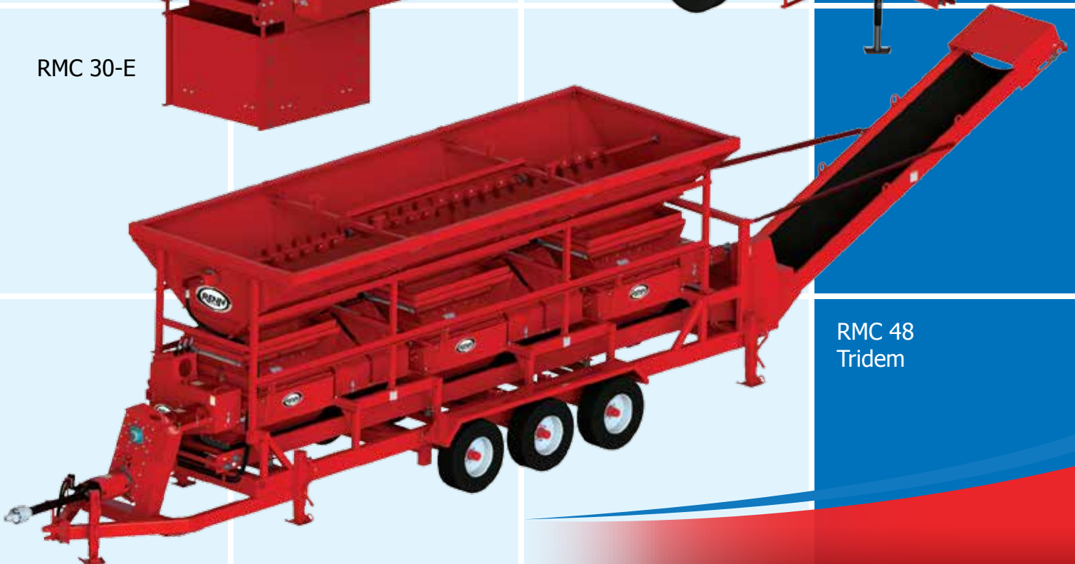
RMC 48 Tridem