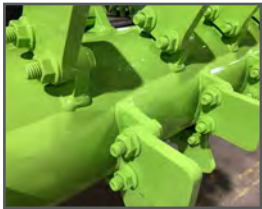
Replaceable teeth 4" & 2 1/2" 450 BHN steel