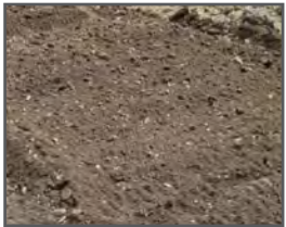
After Multi Rake use