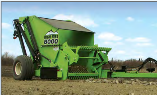
High Rise 8000