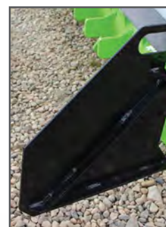
Adjustable, reversible side plates