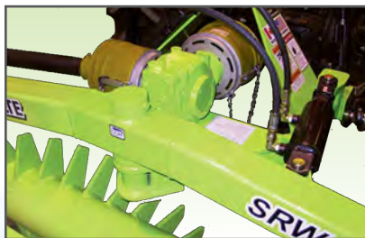
Heavy duty PTO driveline