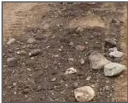
Before Multi Rake use