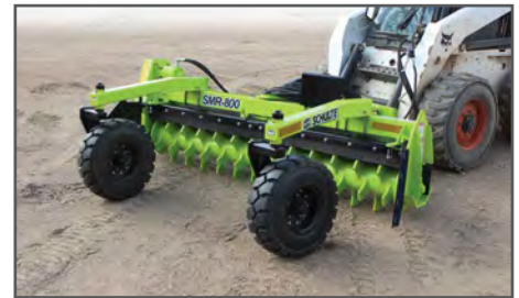
Legendary Schulte quality