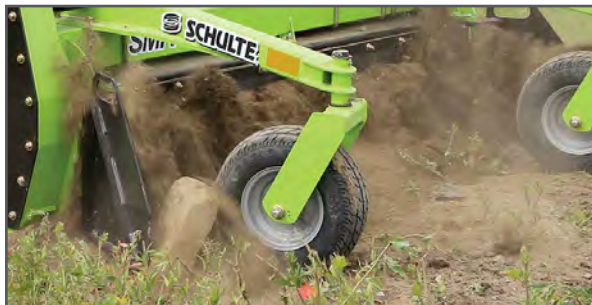
Great for land use soil preparation

The #80 drive chain is located in a sealed chain case and run in an oil bath.