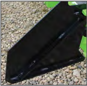
Adjustable, reversible side plates can be mounted on front or back of the unit