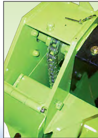
Fully enclosed final drive chain