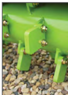
Replaceable teeth 4" & 2 1/2" 450 BHN steel