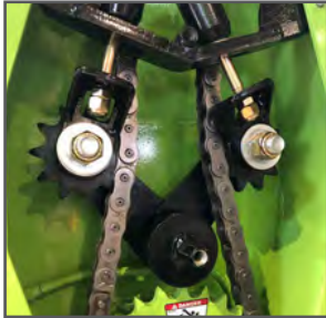
Chain case with tensioner and heavy #80 chain which is run in an oil bath and accessible with an easy access cover plate.

Hydraulic motor options are available to suit skid steer hydraulic flow.