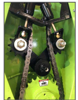
Chain case with tensioner and heavy #80 chain with easy access opening plate.