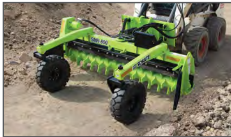
Excellent for land preparation and debris removal