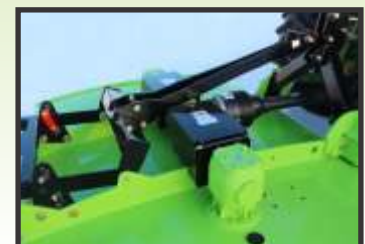
- Three Point Hitch -