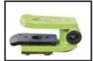
- Adjustable Clevis Hitch -