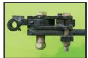
- Precision Hitch -