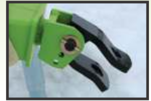
- Open Clevis Hitch -