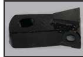
- Solid Tongue Hitch -