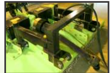
- Semi Mount Swing Hitch -