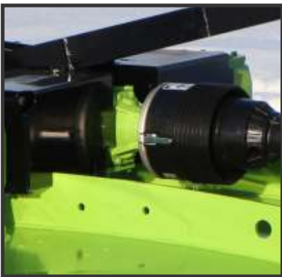
- Reversing gearbox for push/pull -