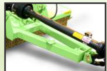
- Trailing Hitch -