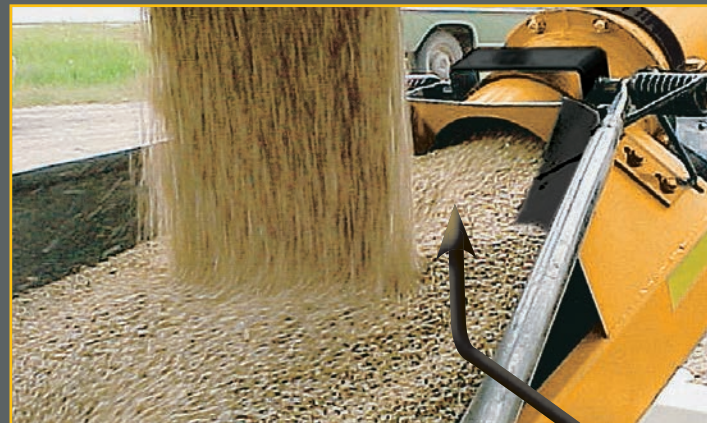
FULL TUBE = BIG CAPACITY