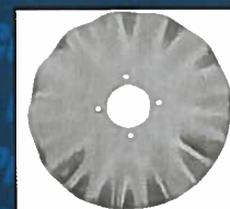
AP 2728 17" x 3/4" x 12 Wave AP 2713 17" x 1" x 8" Wave AP 2719 17" x 2" x 8" Wave