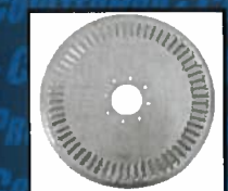
AM 2700 17" Fluted Blade