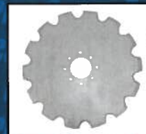
AM 2479 17" Notched Blade

Wings can be locked into position or unlocked and allowed to float over uneven terrain