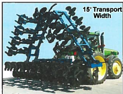
15' Transport Width

BLU-JET's unique folding wing utilizes a special inboard hinge design that allows the folded wings to lie completely inside the 15' width of the center section on all models except 20' rigid model. The wings can be positioned to float over uneven field terrain (from 7-1/2 degree below level to 13 degree above level-range of approximately 44") or locked into place with sturdy pins.