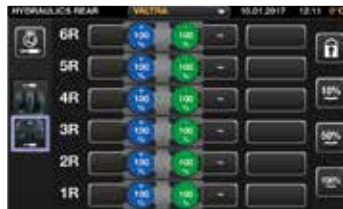
Easy configuration of worklights from the terminal. Worklights on/off switch in the armrest with beacon on/off switch.