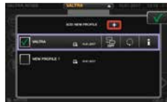
Profiles for operators and implements which can be easily changed from any screen menu. All the setting changes will be saved in the selected profile