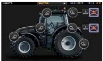
From any control you can control any hydraulic service including hydraulic valves (front and rear), linkages (front and rear) or front loader