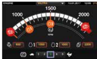
Logical to set up settings with swipe gestures. All settings are automatically stored in memory.