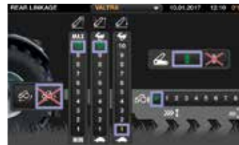
Intuitive way to set up settings with large controls and easy to understand functions.