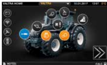
Easy to navigate menu structure.