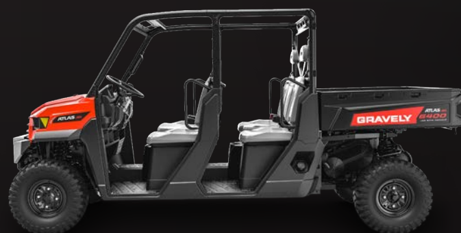
ATLAS JSV 6400

Put equipment in the hands of the ones who need it most with financing options through Gravelly. Accelerate getting the tools you need to get the job done with affordable plans provided through our network of authorized independent finance companies.