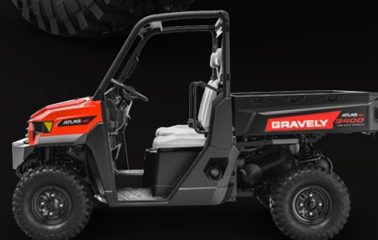
ATLAS JSV 3400