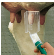
Precise measurement of the teat: means correct liner fit to maximise milk yields.

for improved udder health and teat condition