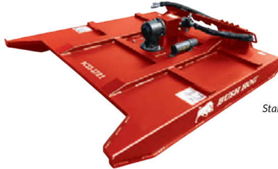
BCSS-S721 Standard Single Spindle

BCSS open front models share many of the same premium design features including solid one piece steel decks, high tempered steel blades, balanced stump jumpers and welded collars underneath the deck. The single spindle standard design offers cutting widths of 60" and 72" with cutting capacity of 3"– 4". Available in 72" cutting width, the HD single spindle design with push bar feature offers a cutting capacity of 3"– 5". Select your preferred design and pair with the appropriate carrier based on hydraulic flow (GPM).