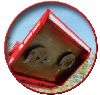
Offset Multi-Spindles and Blades