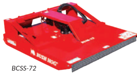
BCSS-72 Single Spindle

The Bush Hog line of BCSS skid steer brush cutters makes clearing brush and saplings easy with a selection of models designed for durability and performance. The closed front models boast heavy duty design features including solid one piece steel decks, long-lasting high tempered steel blades, balanced stump jumpers and welded collars underneath the deck to ensure years of solid performance. Complementing the heavy duty structural elements, all BCSS brush cutters incorporate optimal hydraulic motors and right angle gear boxes to achieve peak production – characterized by the highest torque available and sustained blade tip speeds proven effective in brush cutting applications. Shipped in HD wooden crates for added protection, each unit comes with hoses, couplers and gearbox guard for true “plug and play” – just pair with the appropriate carrier based on hydraulic flow (GPM) and start clearing a path.