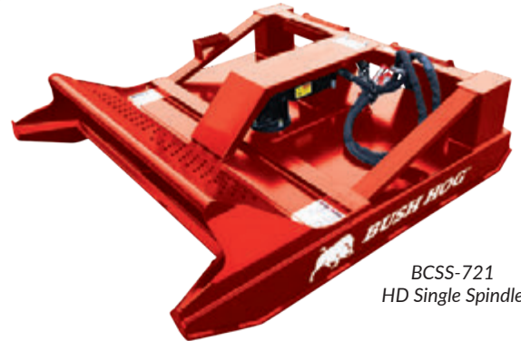
BCSS-721 HD Single Spindle