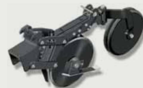
"Heads Up" Opener Design