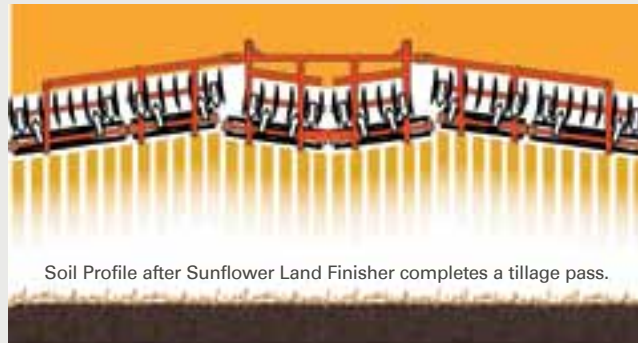
Soil Profile after Sunflower Land Finisher completes a tillage pass.