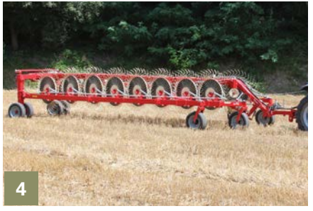
[1] Individually spring loaded wheels prevents digging into the ground [2] Simple swath adjustment achieved with a bushing system; three preset widths available [3] Optional center mounted hydraulically operated wheel rake available for moving forage in the central zone. [4] Maximum transport width of 9.2'.