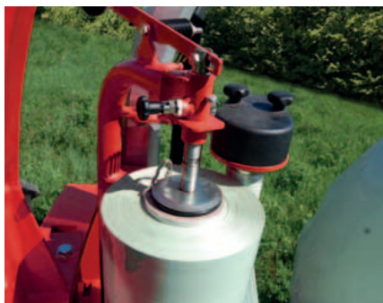
Easy film roll replacement.