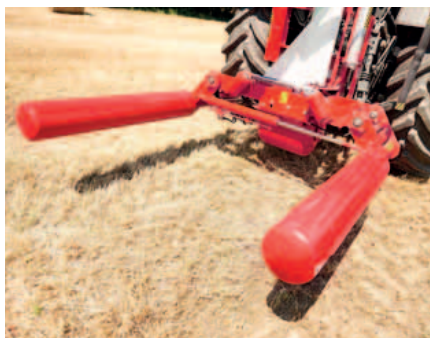
Easy and gentle self-loading of the bales – the bale is gently lifted by the rollers.

During loading, the bale is lifted straight up, in order to prevent it from being contaminated, and when the bale is unloaded, it is gently lowered rather than being tipped off.