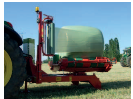
Wrap and bale counter is standard.

Once the wrapping process is activated the whole operation is running automatically. You only need to push the button again to unload the wrapped bale. An optional automatic stop by end of film/film tear ensures that the process is stopped in order to avoid wrongly wrapped bales. Kverneland 7710 is controlled by a computer with an integrated bale counter. Remote control is available as option, making it the ideal solution for static use.