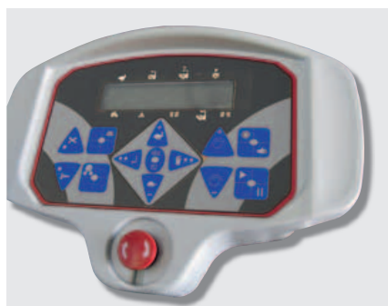
Monitor for the programming and control of the full wrapping cycle ...