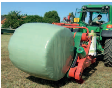
Low table height for fast and gentle unloading.