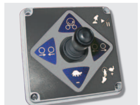
... and joystick controlling the main functions.