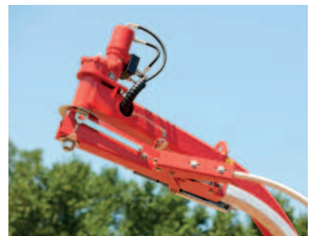
Strong satellite drive.