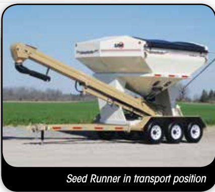
Seed Runner in transport position

The dual-compartment Unverferth Seed Runner™ seed tender not only delivers seed to your planter or drill, its patented design allows the conveyor to rotate 180° for filling itself! You can even position the conveyor parallel to the tender and transfer seed from one container to another. That's 3-way versatility — loading, unloading and transferring — for three times the value.