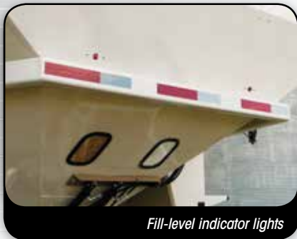
Fill-level indicator lights