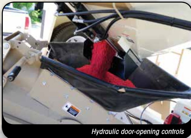
Hydraulic door-opening controls