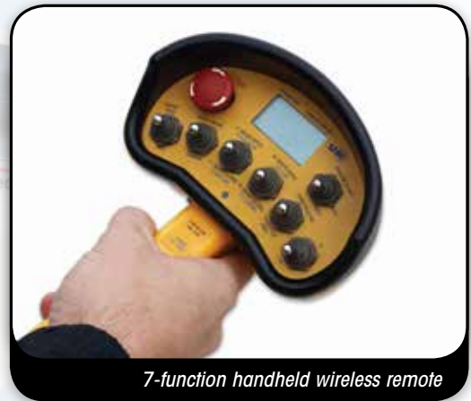
7-function handheld wireless remote