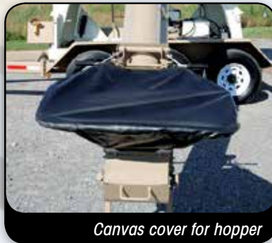
Canvas cover for hopper