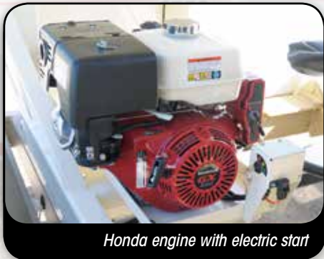
Honda engine with electric start