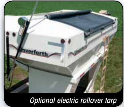
Optional electric rollover tarp