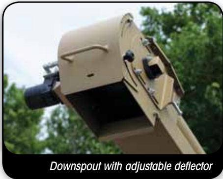
Downspout with adjustable deflector