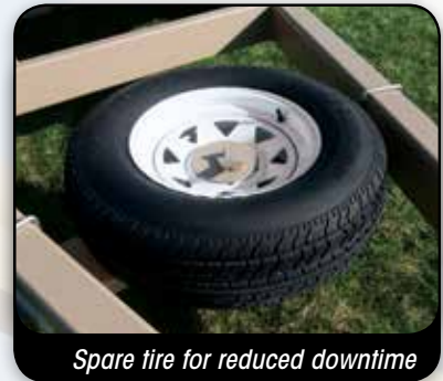
Spare tire for reduced downtime