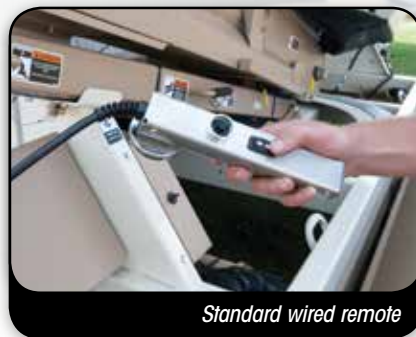
Standard wired remote