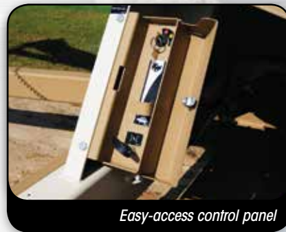
Easy-access control panel