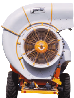
Arbus 4000 Valência Arbus 4000