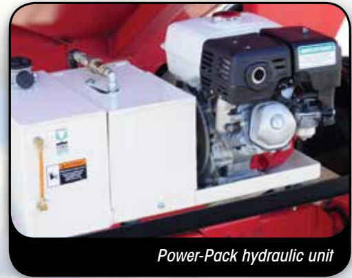
Power-Pack hydraulic unit