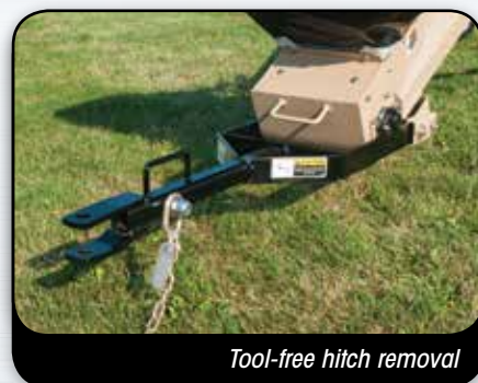
Tool-free hitch removal