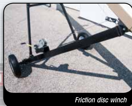
Friction disc winch