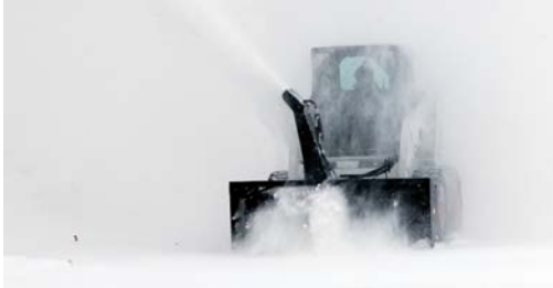
[1] Hydraulic motor chain drive. [2] Wiring harness fits most skid steer brands. [3] A hydraulic motor mounts directly on the fan and auger shaft eliminating couplers and chain drive assembly.