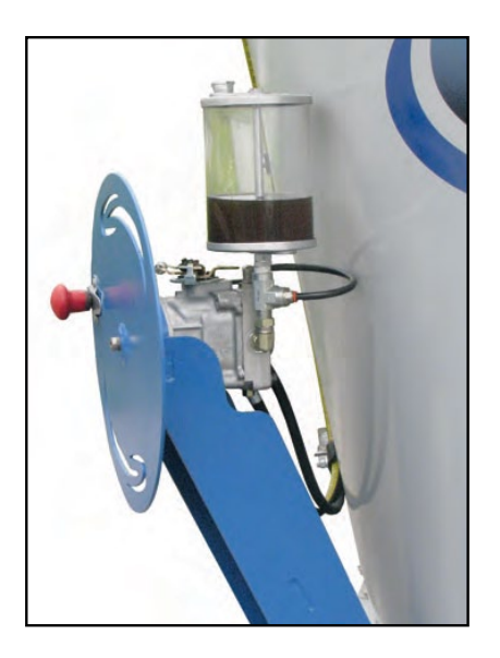
Manual Hydraulic Door Opener