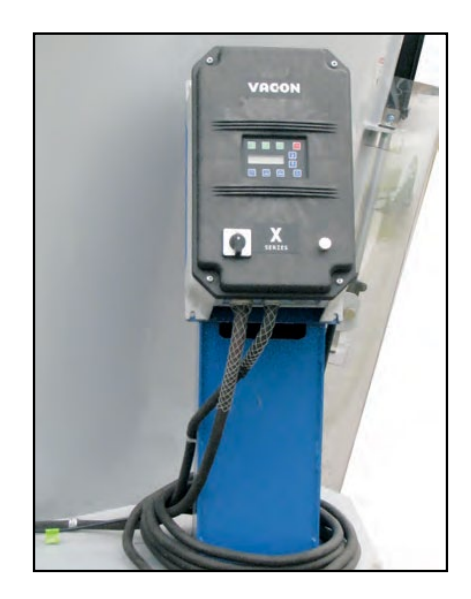
Variable Frequency Drive 1-60 rpm Auger Speed