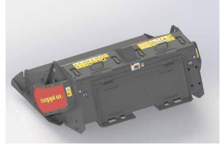
► YouTube www.youtube.com/seppimulcher