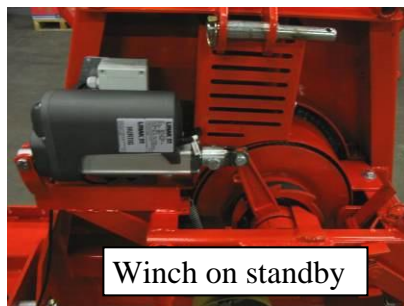
Winch on standby