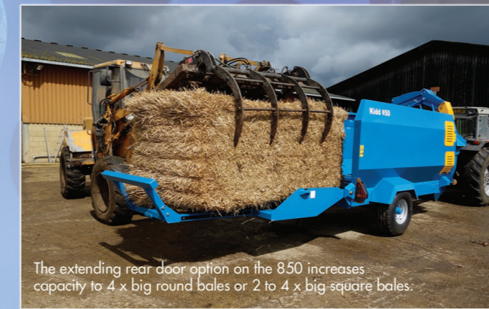
The extending rear door option on the 850 increases capacity to 4 x big round bales or 2 to 4 x big square bales.