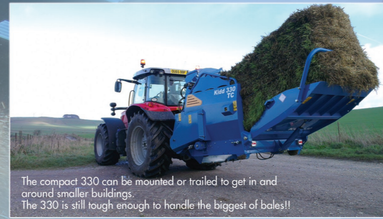
The compact 330 can be mounted or trailed to get in and around smaller buildings. The 330 is still tough enough to handle the biggest of bales!!