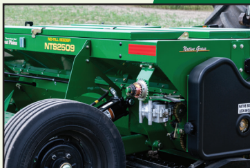
NATIVE GRASS BOX