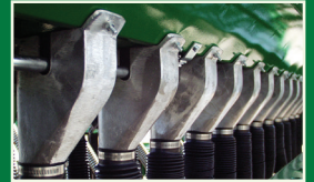
Native Grass Box (optional)