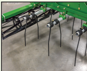
3-BAR COIL TINE & REEL