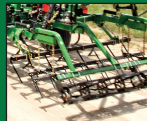
3-BAR SPIKE & REEL