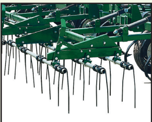
4-BAR COIL TINE