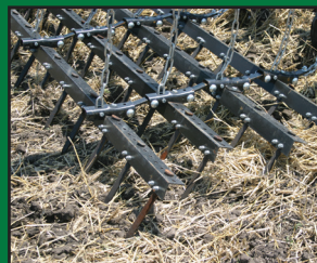
4-BAR HIGH-RESIDUE SPIKE