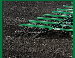
3-BAR COIL TINE & REEL