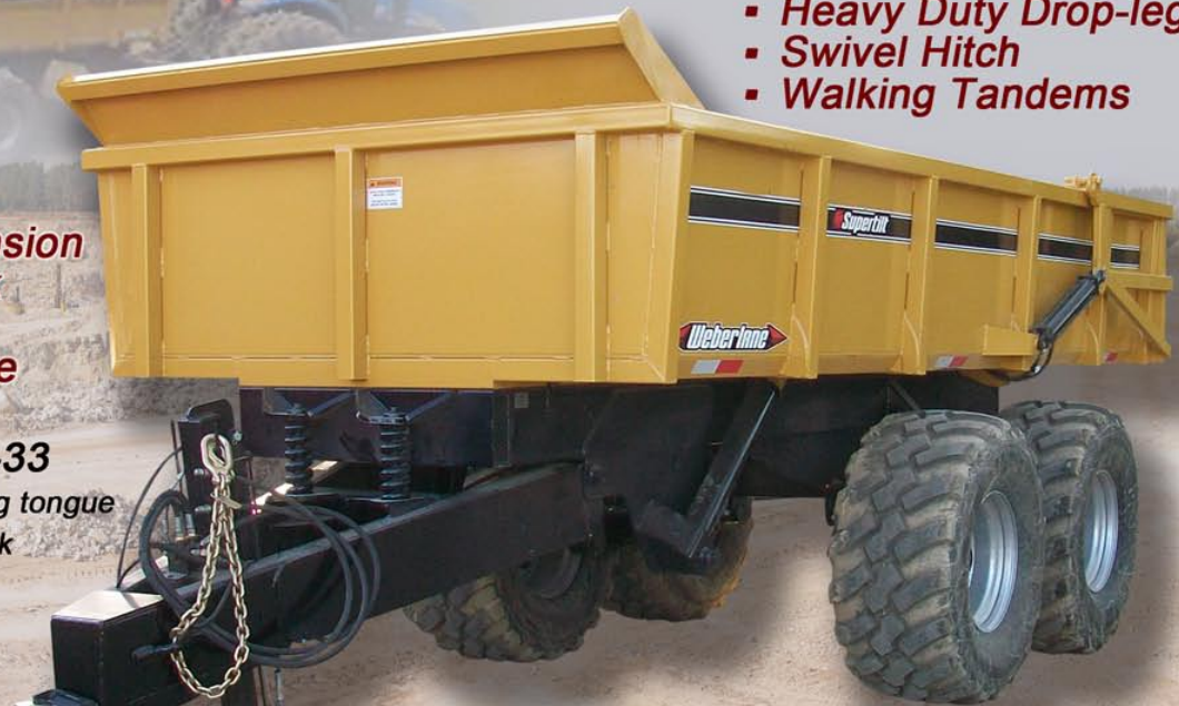
#WLHDT20-33 shown with spring tongue and hydraulic jack