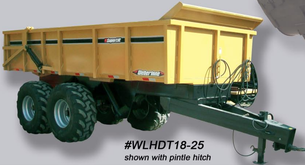
#WLHDT18-25 shown with pintle hitch