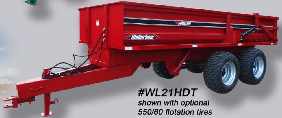
#WL21HDT shown with optional 550/60 flotation tires