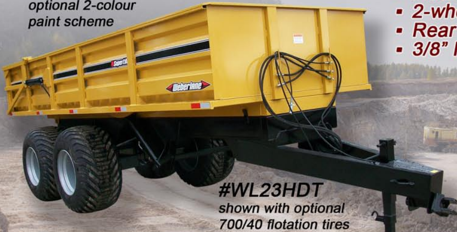
#WL23HDT shown with optional 700/40 flotation tires