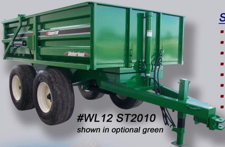
#WL12 ST2010 shown in optional green