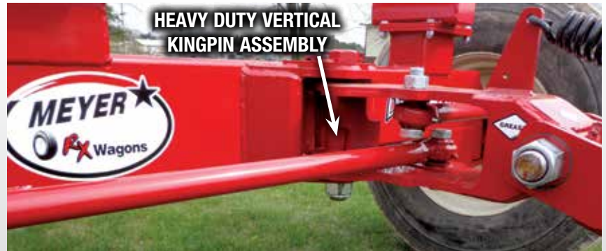
HEAVY DUTY VERTICAL KINGPIN ASSEMBLY

ure T-Type Steering design for strength and accuracy. The erred bearings for ease of steering while eliminating stress iving parts including tie rod pivots are greaseable!