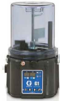
Optional automatic greasing system