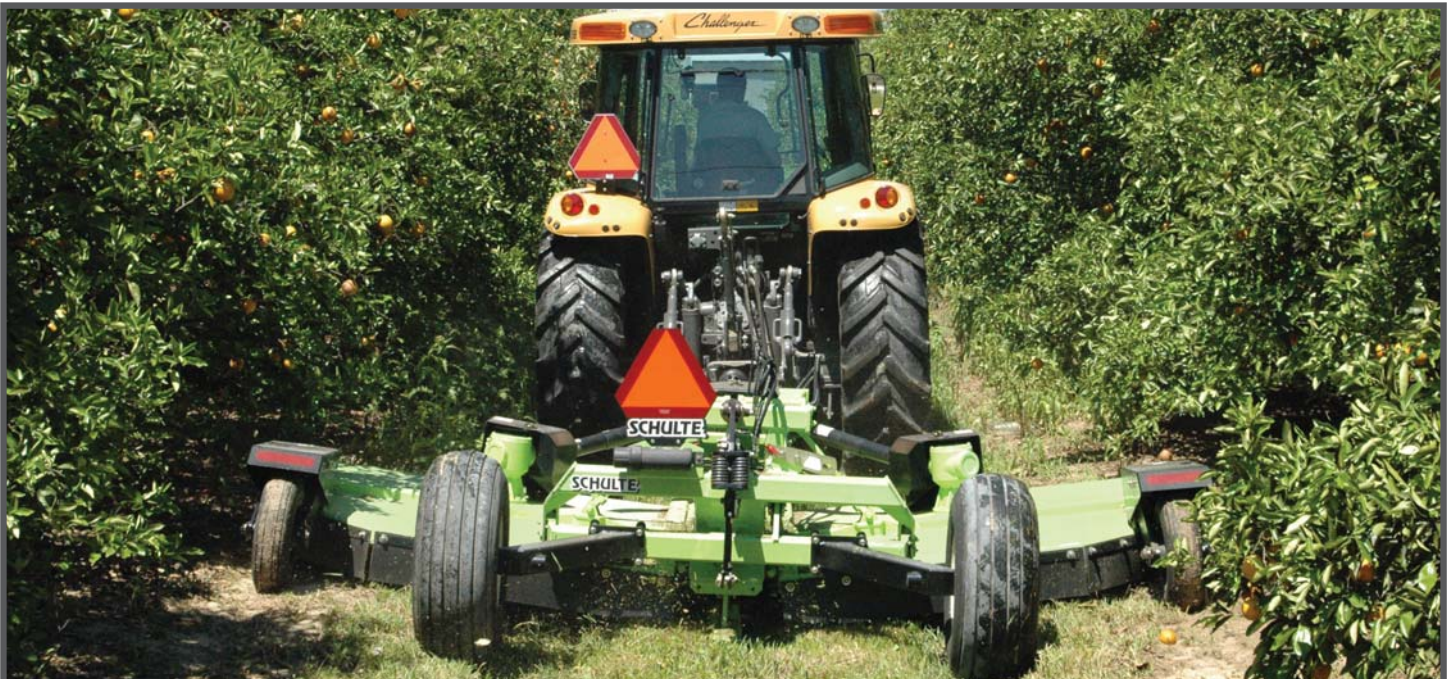
- The V Mower that truly works in V furrow planting! -