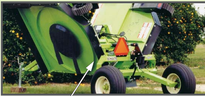
Schulte's unique deck protection rings come standard, and keep the V1280 working while others are in the welding shop.