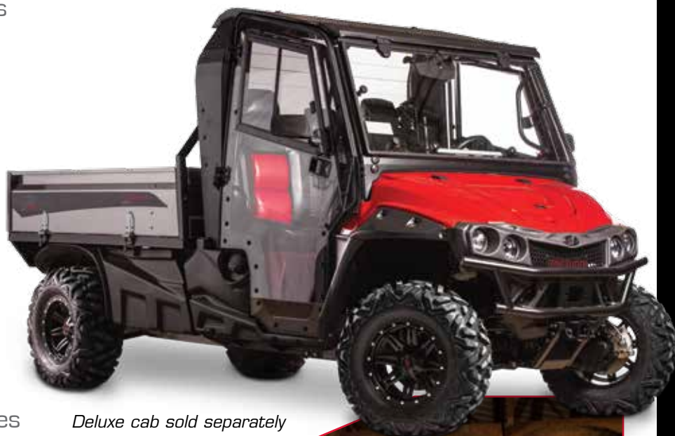
Deluxe cab sold separately