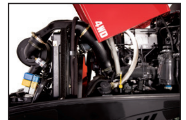
Engine – left side view