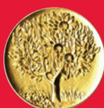
JAPAN QUALITY MEDAL 2007