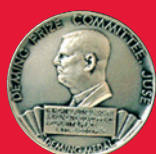
DEMING PRIZE 2003