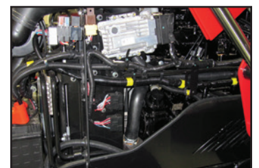
Engine – left side view

*mCRD™ Technology on 1533 and 1538 models.