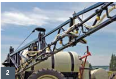
[1] Boom suspension [2] Lattice-style boom [3] Frame [4] Custom solution tank [5] Tires and axles

The simple and efficient design make the Farm King utility sprayer easy to operate and maintain. Boom height adjustments are easily made using the single hydraulic cylinder and vertical mast. Farm King Utility Sprayers are available with 60' booms.