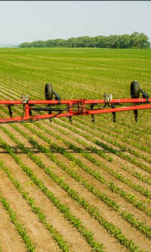
[1] Folded for transport [2] Rotational lift toolbar [3] Asymmetrical tank design [4] Tires and axles [5] Transport position

The 1860 and 2460 have an impressive in row crop clearance of 36" and more than 54" of crop clearance on headland or turning rows. A custom designed asymmetrical tank helps maintain a consistent tongue weight regardless of the product volume in the tank. The cutting edge design and easy to use operation make the 1860 and 2460 the best available 60' applicators on the market.