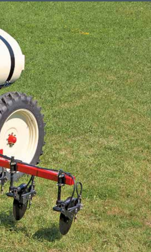
[1] Wing lock [2] Flow controls [3] Coulters [4] Flow monitors [5] 3" quick fill

The ideal size and product features make the 1410 an excellent addition to any farm. Available with John Blue ground driven pump or Ace hydraulic centrifugal pump the 1410 can be customized to suit the needs of most operations.