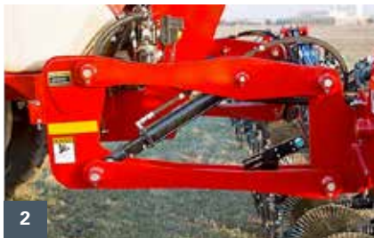
[1] 175" wheelbase [2] A wide stance, high clearance, parallel lift linkage [3] Hydraulic valve block [4] Visual flow monitor system [5] Toolbar proximity sensors

Combined with the field proven asymmetrical tank design, this robust unit's short wheelbase tracks exceptionally well in all field conditions.