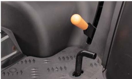
Differential lock is standard with foot pedal engagement for SA223, SA325, and SA425.