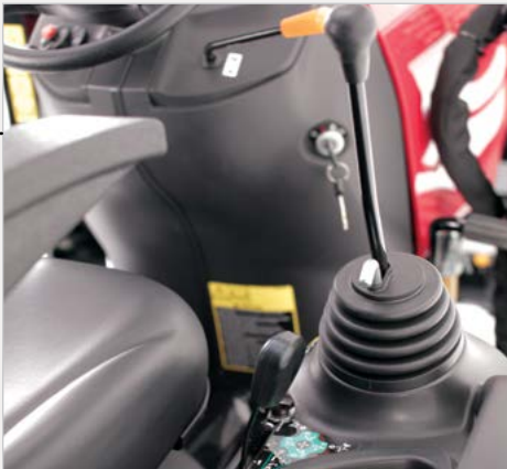
Work comfortably with armrest-mounted loader control lever, while True Position Control lever (below joystick) delivers precise operating height of rear implements.