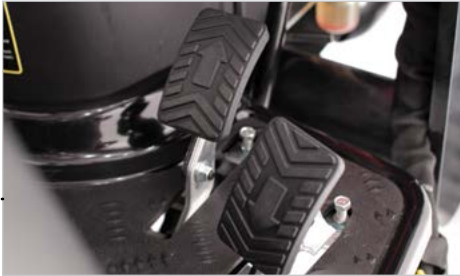
Switch seamlessly between forward and reverse with two side-by-side hydrostatic transmission pedals.