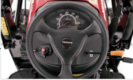
Simple to operate; easy access to every control.